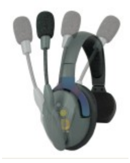
Boom swivels so headset can be worn on left or right.