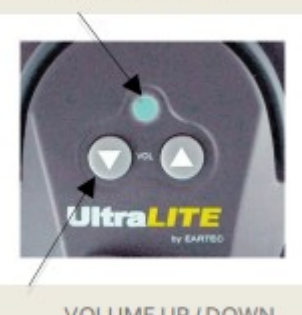
VOLUME UP / DOWN